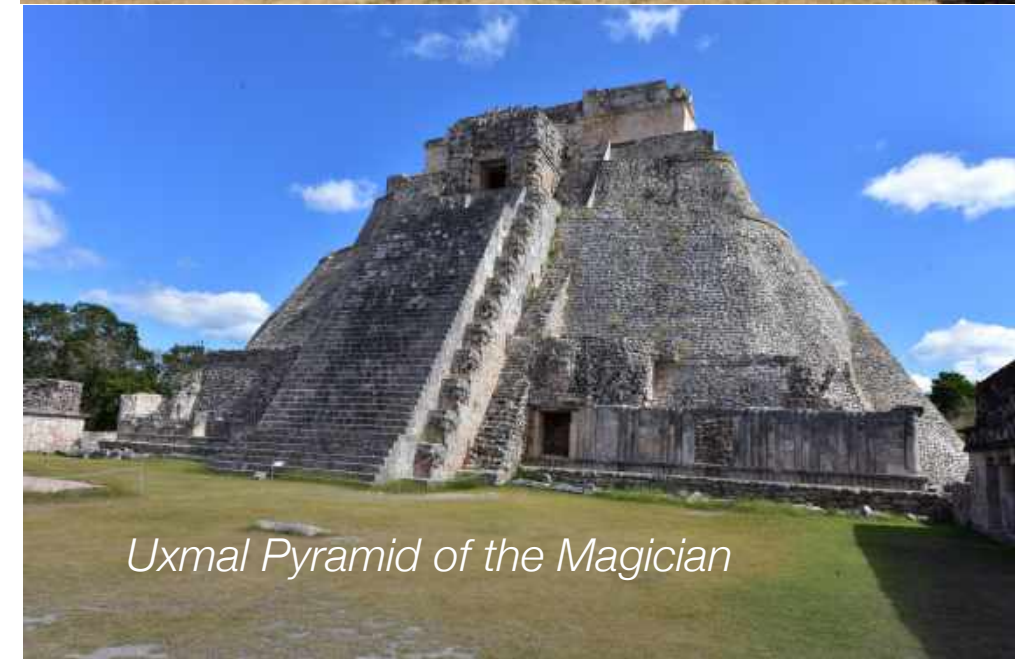
Uxmal Pyramid of the Magician