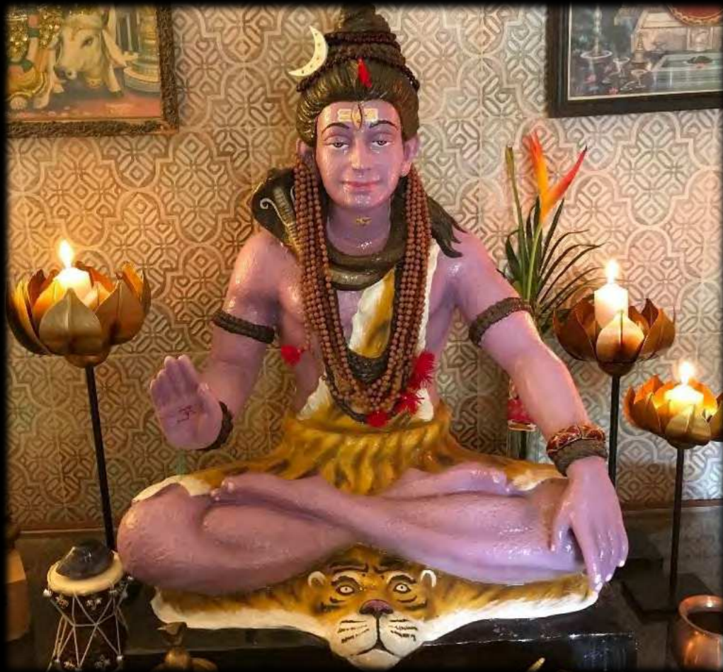
Violet Ray Shiva Temple Onsite at TBM!