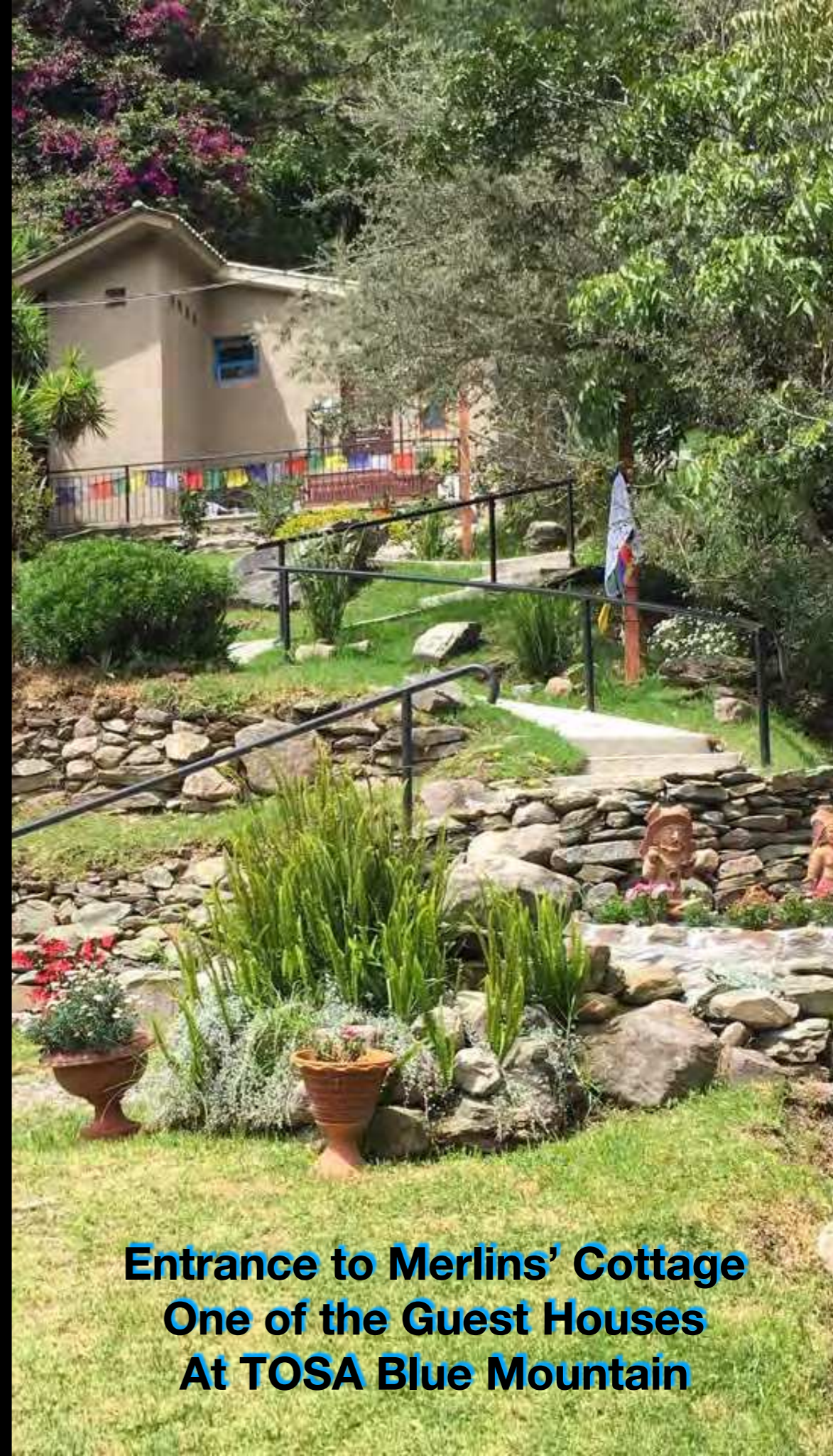
Entrance to Merlins' Cottage One of the Guest Houses At TOSA Blue Mountain