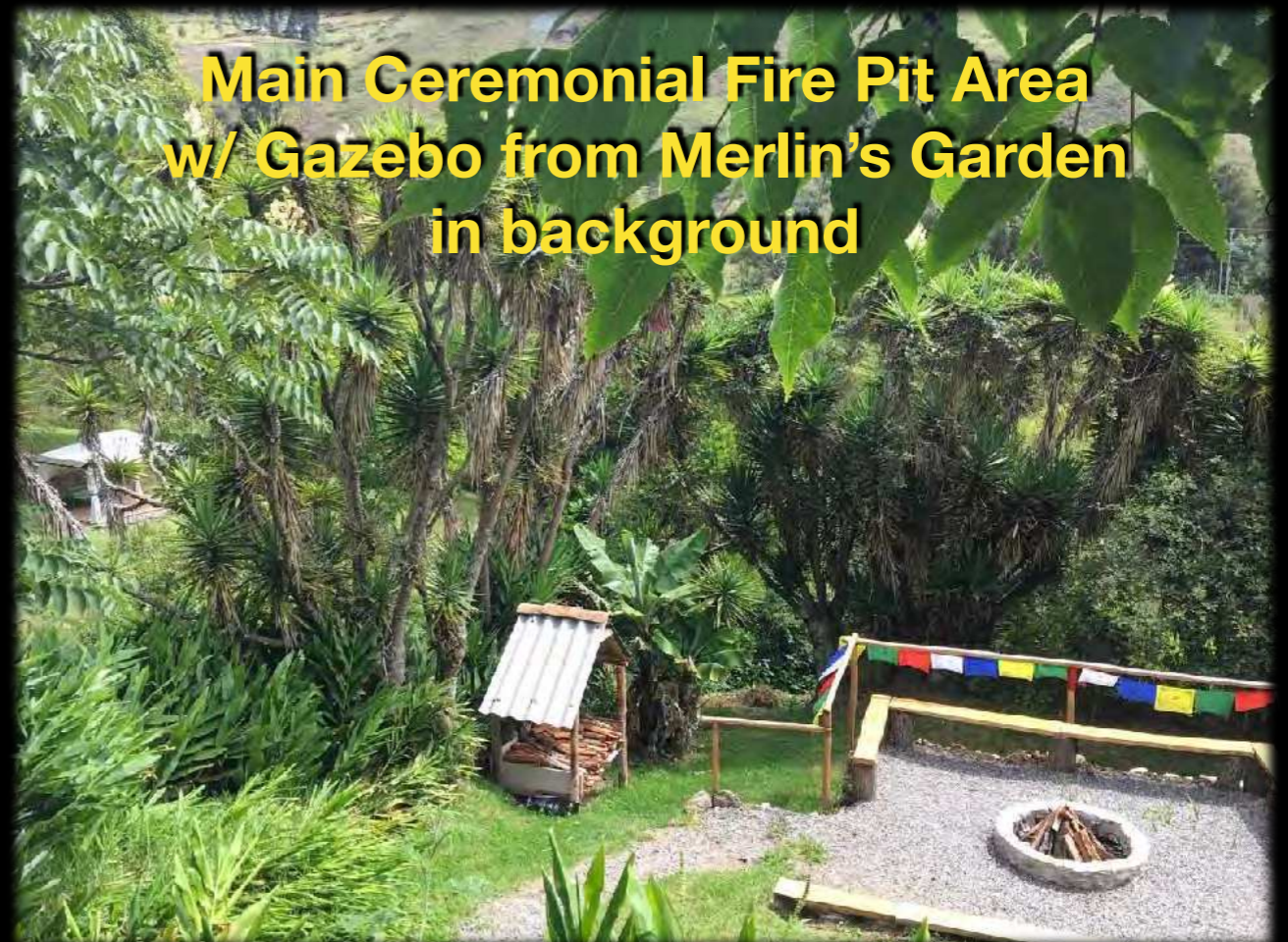
Main Ceremonial Fire Pit Area w/ Gazebo from Merlin's Garden in background

Or...consider staying and going even deeper with a SECOND SanPedro Journey or onsite extension with personalized attention to your needs!