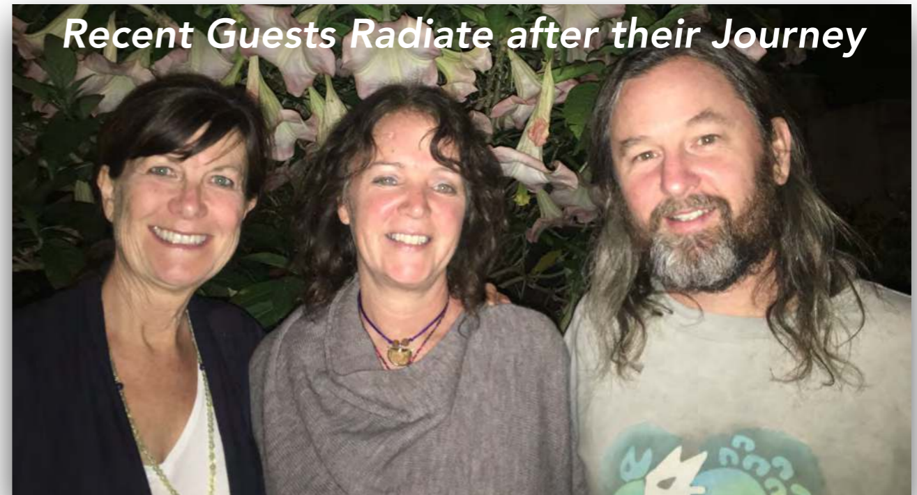
Recent Guests Radiate after their Journey

TBM is blessed to be IN THE SACRED VALLEY of the Andes where San Pedro grow organically and abundantly!